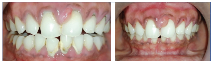
[Table/Fig-1]: Clinical image at the time of initial visit. Gingival lesion involving marginal and interdental papilla on the mesial aspect of 21. [Table/Fig-2]: Fourth week of review after scaling and root planing. The lesion has not regressed in size. (Images from left to right)

reviewed at 2 nd and 4 th week [Table/Fig-2]. Intraoral radiographic image taken after scaling and root planing showed radiolucency between 11 and 21 suggestive of incisive foramen and there were no signs of osseous involvement [Table/Fig-3]. Since the lesion did not regress in size, surgical excision of the lesion was planned.