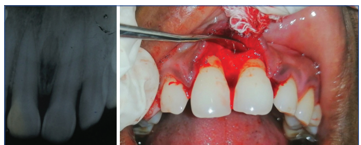
[Table/Fig-3]: Radiographic image taken after SRP showed radiolucency between 11 and 21 suggestive of incisive foramen and there were no signs of osseous involvement. [Table/Fig-4]: Surgical elevation of the flap from 11 to 22 after excision of the lesion. (Images from left to right)

Under local anaesthesia (2% Lignocaine with 1:80000 adrenaline), excision of the lesion was done with a # 15 Bard Parker (BP) blade at the base of the lesion after which the flap was elevated from 11 to 22 [Table/Fig-4]. Thorough debridement of the surgical area was carried out and the flap was sutured back in position with 3.0 black silk sutures. Periodontal dressing was given. The excised specimen was stored in 10% neutral buffer formalin and sent for histopathological examination. Histopathological report revealed a mass of connective tissue covered by parakeratinised stratified squamous epithelium which appeared