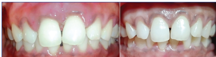
[Table/Fig-6]: First week postoperative image after flap surgery. [Table/Fig-7]: Postoperative image at 9 th month review. (Images from left to right)

The patient was reviewed up to 9 th month and healing was uneventful without any complications [Table/Fig-7]. Patient is still under follow-up to monitor if any recurrence of the lesion occurs.